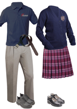
Uniforms Shoes, Belts

HEAP 2011 involves two fold activities, Saadhya and Saadhana . Saadhana focuses on providing external assistance to foster education (school-kits, computers, library books, etc) and Saadhya initiatives try to work on the minds of individuals and increase their knowledge (Train the Teachers, Competitions, Educational trips, Science experiment kits, etc).