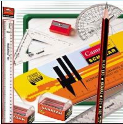
Geometry box, Erasers, Pens, Pencils, Crayons etc