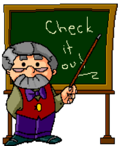
Aacharya Dakshina (Teacher's Salary)